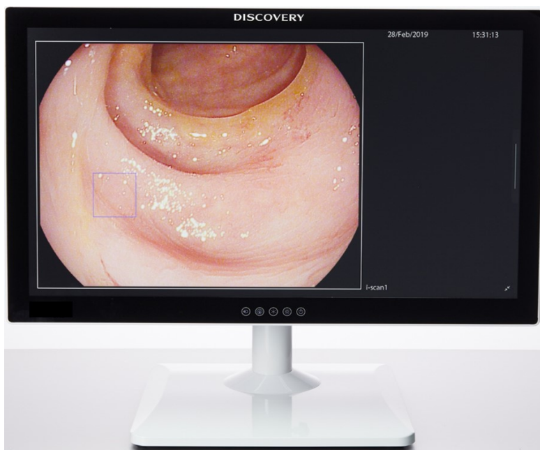
Fig. 3. DISCOVERY (PENTAX Medical, Tokyo, Japan) incorporates the artificial intelligence based on a deep neural network in a panel PC with a 32 inch LCD display. This panel PC can be connected with a signal cable (DVI/ HD-SDI) to each PENTAX HD+ video processor for integration and is intended to be used as a secondary monitor.