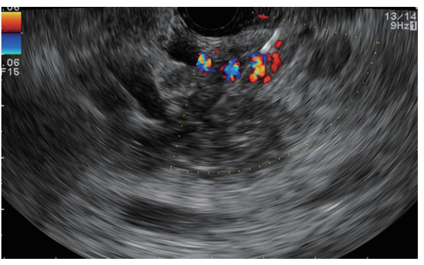
Fig. 3. The presence of collateral vasculature makes tissue acquisition more challenging in chronic pancreatitis.

Elasticity imaging has been reported to be useful for the differentiation of benign and malignant tissues, owing to the inherent differences in the hardness of tissues. Malignant tumors are usually stiffer than benign masses, and the strain in-