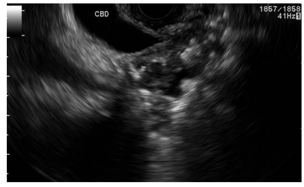
Fig. 2. Hyperechoic shadowing by a pancreatic duct stone obscures an underlying pancreatic adenocarcinoma.